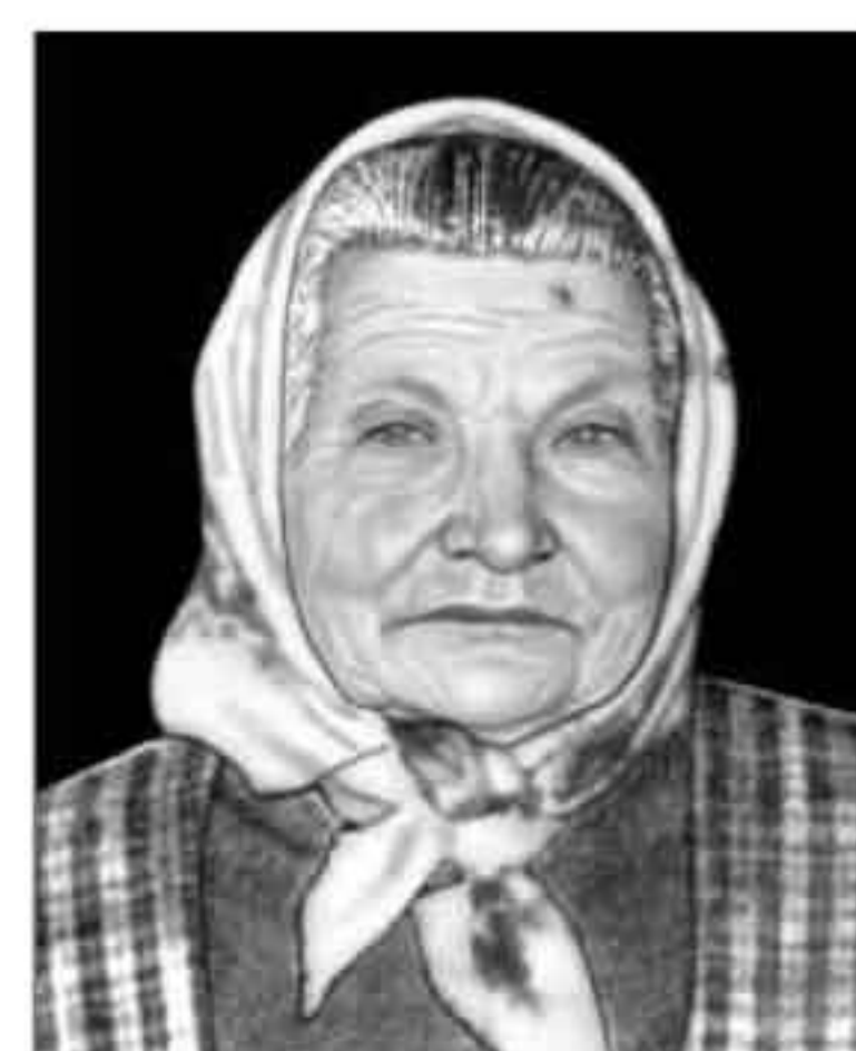
Manually highlight the facial details and hair