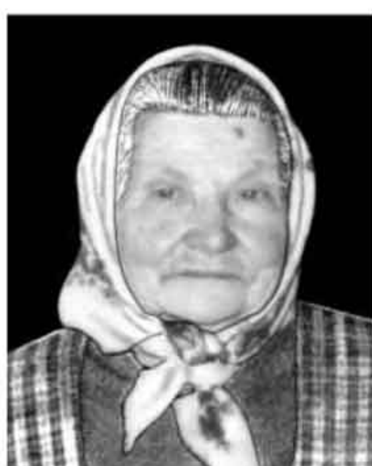
Manually highlight the clothing details