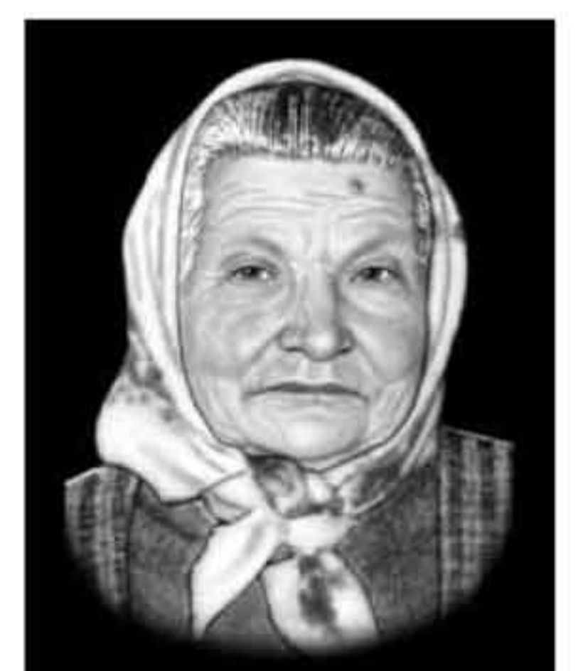
Create oval-like shape at the bottom