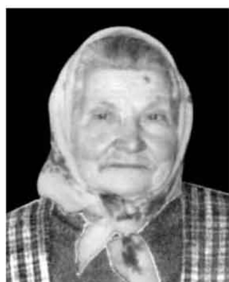
Remove background, adjust brightness and contract