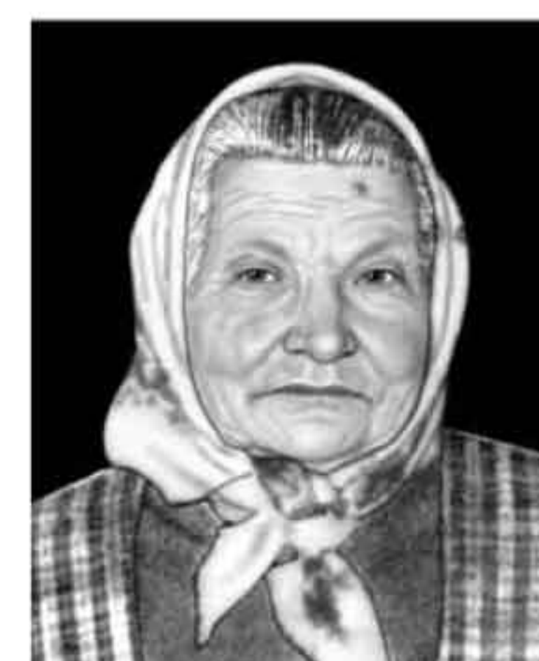
Improve eyes appearance.