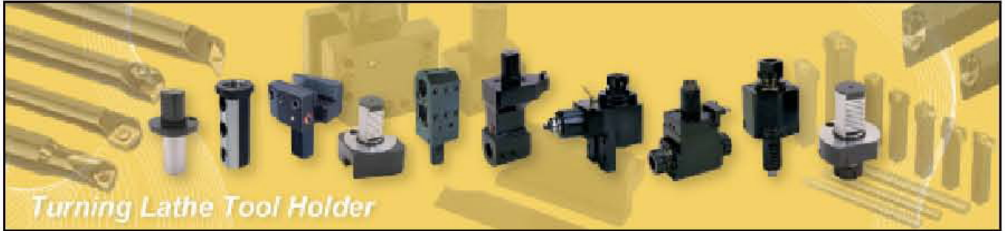
Turning Lathe Tool Holder