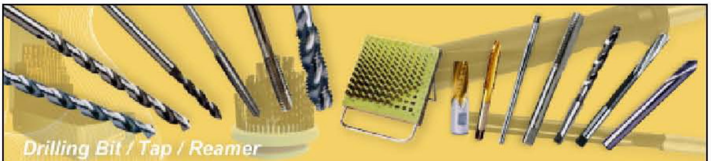
Drilling Bit / Tap / Reamer