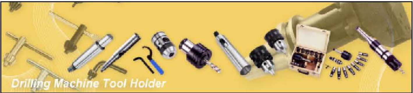
Drilling Machine Tool Holder